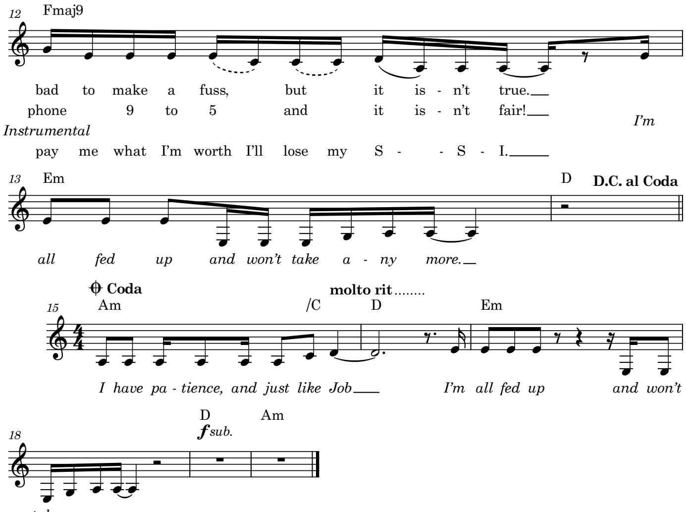
take a - ny more.